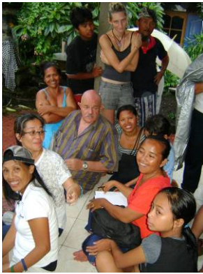
Sheltering from the rain at the Kapala Desa's house